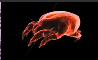
MICRO-FINE DUST AND DUST MITES